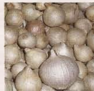
Pearl onions are not hard to find.

I suggest soaking a cheesecloth pad in butter and placing it over the breast. Throw a little of the pan juices on every now and then to keep it from drying