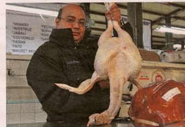
Butchers at the San Juan Market offer plump, farm-raised gobblers.

All that said, you might decide to forget the whole thing and go out for tacos.