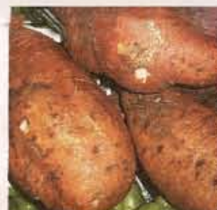
Sweet potatoes are also a favorite.

out. The taste of these birds is incomparable, and they can be reserved ahead of time.